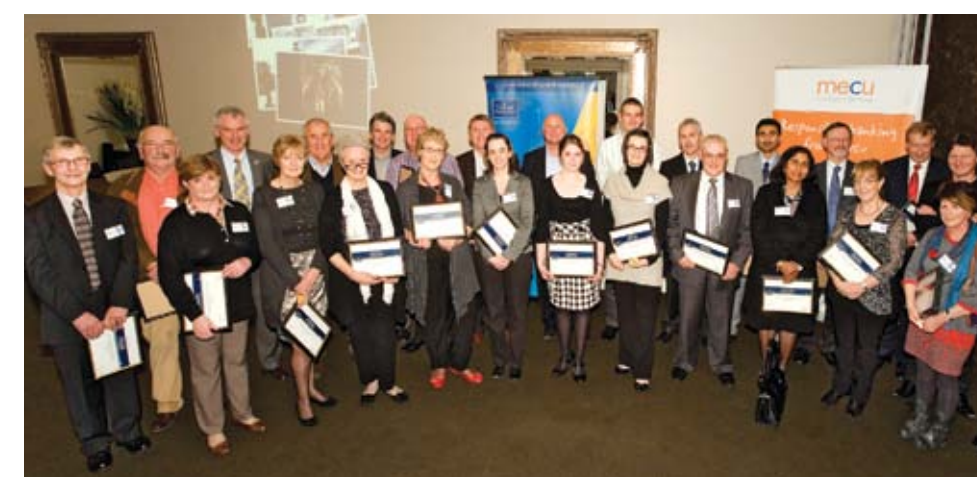
Our new ambassadors showing off their certificates and lapel pins.

The Ballarat Foundation is your Community Foundation, owned by the community and working for the community. We receive and invest funds using investment income to support the community in which we live both now and for the future. We provide guidance and advocacy to individuals, groups and the community in general. We consistently look for support through donations, gifts and bequests. Please consider what we can do to help you to help your community. Established ten years we have delivered over $1.4 million in support to over 150 organisations and have amassed $2 million in invested funds. To learn more about the Foundation go to www.ballaratfoundation.org.au or call us on (03) 5329 4613