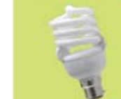
energy-saving light bulbs