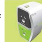
standby power controllers