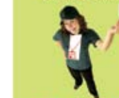
qualified installers police checked & photo'd

For each assessment Save & Raise will contribute up to $30 to The Ballarat Foundation